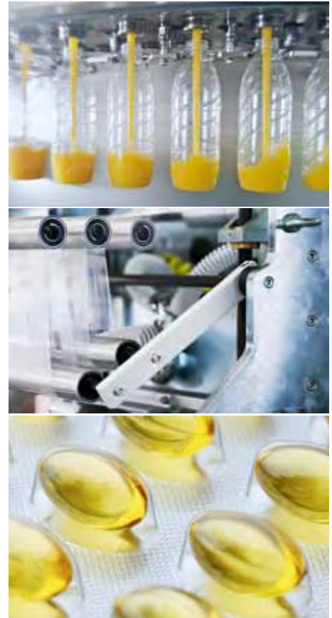
Detection of highly transparent materials, in the food industry, graphical industry or in packaging technology, etc.